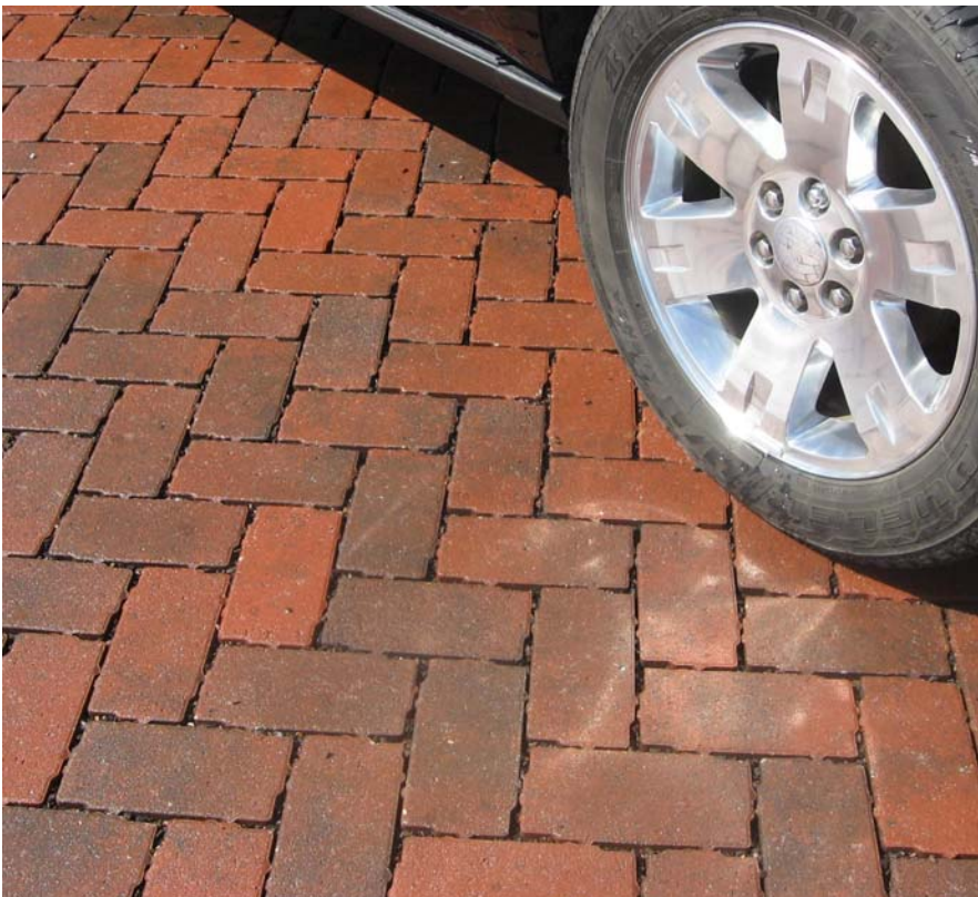
Aqua-Bric™ Type 1